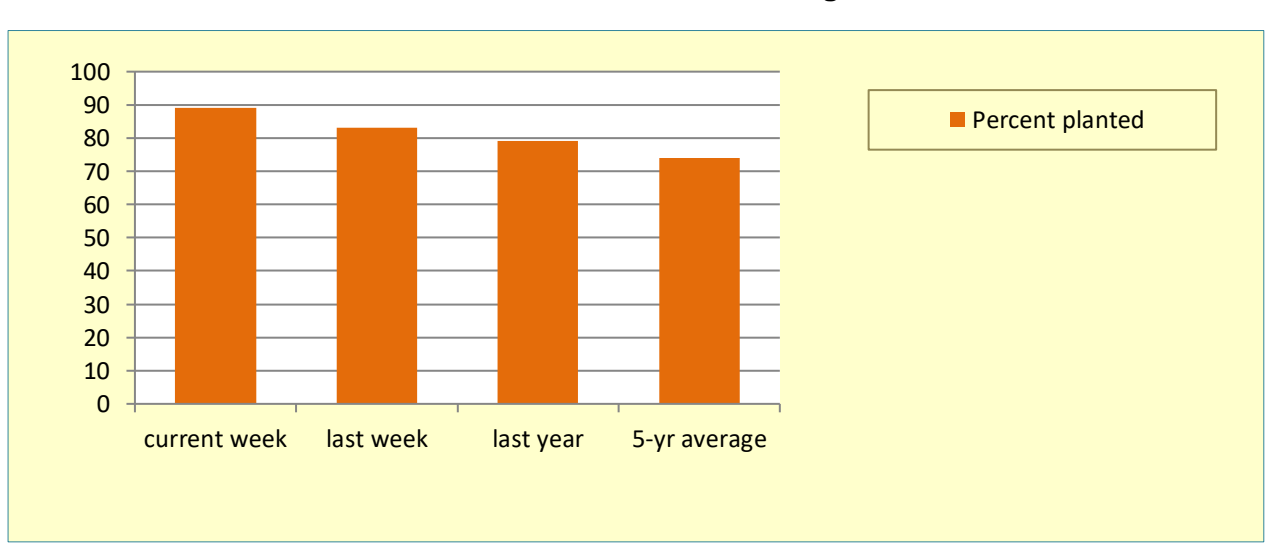
Weather Summary- For the week ending June 12, 2022