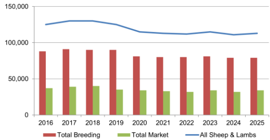
Sheep and Lamb Inventory - Minnesota: January 1

All sheep and lambs inventory in Minnesota as of January 1, 2025, totaled 113,000 head, up 2,000 head from 2024, according to the latest USDA, National Agricultural Statistics Service – Sheep and Goats report. Total breeding stock , at 79,000 head, was unchanged from one year ago. Market sheep and lambs increased 6 percent from a year ago and totaled 34,000 head. The 2024 lamb crop was estimated at 87,000 head, up 2 percent from the 2023 lamb crop. Wool production for 2024 was 610,000 pounds, up 2 percent from 2023, with fleece weights averaging 6.2 pounds.