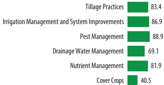
Fig. 1 Cropland Conservation Practice (average % of cropland*)

*among survey respondents who reported using a conservation practice