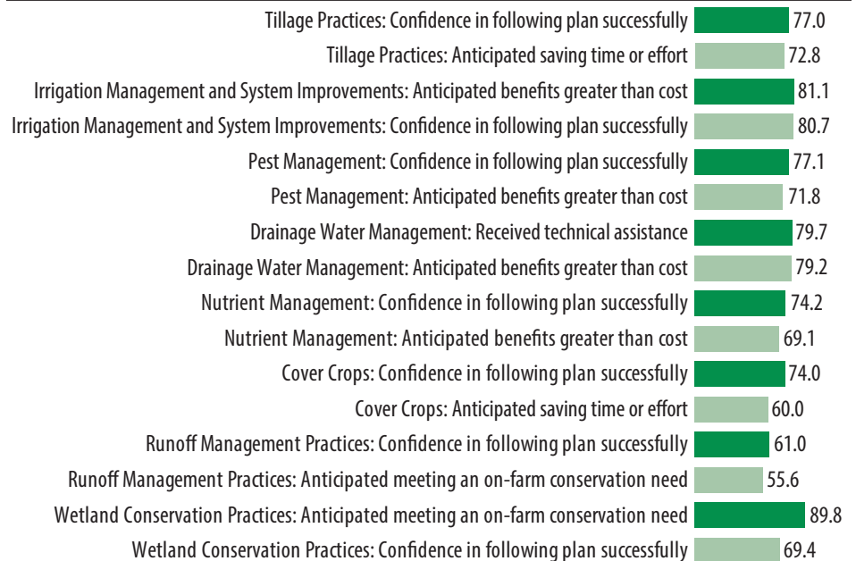
Fig. 3. Top Motivations by Conservation Practice, Cropland (% of survey respondents utilizing)

The two most motivational factors in the decision to utilize tillage practices were confidence in following plan successfully (77.0%) and anticipated saving time or effort (72.8%). Anticipated benefits greater than cost (81.1%) and confidence in following the plan successfully (80.7%) were the two most motivational factors in using irrigation management and system improvements (Fig. 3)