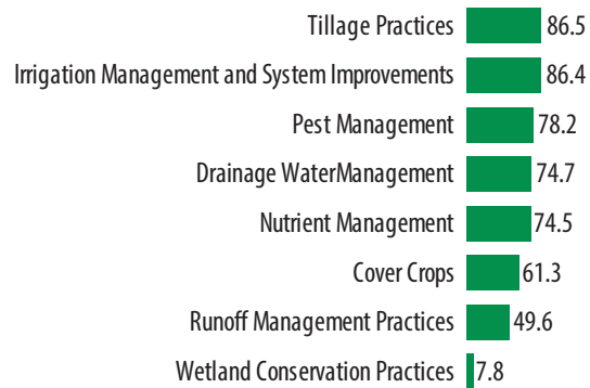
Fig. 2 Cropland Conservation Practice (% of survey respondents utilizing)

Among respondents who reported using specific cropping conservation practices, 86.5% used tillage practices. Among respondents who reported using a specific cropping conservation practice, tillage practices were applied to 83.4% of cropland.